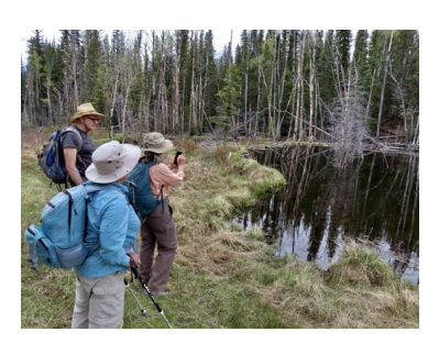
Viewing Beaver Ponds at WC's 2020 Rock Creek Project Monitoring Hike.

Ben Tyler Trail Hike, Rock Creek Project Monitor Saturday, July 20, 10:00 AM - 3:00 PM