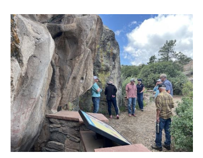
BLM RM RAC June 21 Field Tour to BLM's Penitente Canyon.