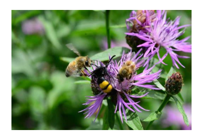
How does Climate Change Affect Pollinators?

Look for our table to find out about upcoming outings and restoration projects that we are scheduling in South Park later this summer and fall.