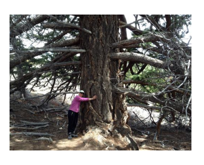
Colorado's alleged largest Douglas Fir - 22 ft in circumference - located contiguous to the Chipeta Roadless Area.

But trees can thrive where Wild Connections invests time and resources! As leaders in the conservation community, we forge coalitions to promote wildlands and wildlife across Colorado. Our dedicated staff is committed to maintaining the organization's financial strength, allowing Wild Connections to advance our vision of a connected network of wildlands.