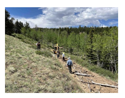
QUC Salt Creek Restoration Project at FS Buffalo Peak RA.