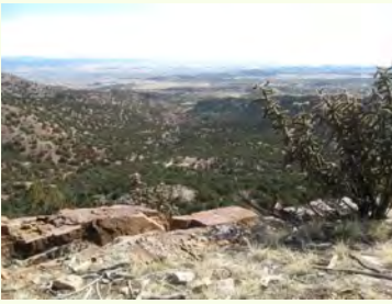
Ecology Park, near Canon City and south of Royal Gorge, is a diverse area of forest, canyons, and hiking and mountain biking trails.

BLM resource management plan, which could affect it and nearby Grape Creek Wilderness Study Area.