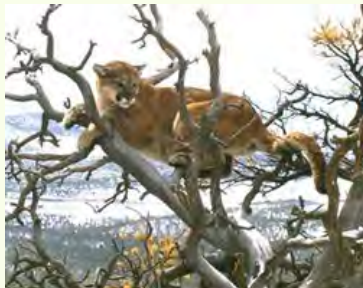
Mountain Lion at Red Rocks.

Engage with Colorado Parks and Wildlife on the East Slope Mountain Lion Plan Public and Virtual Meetings