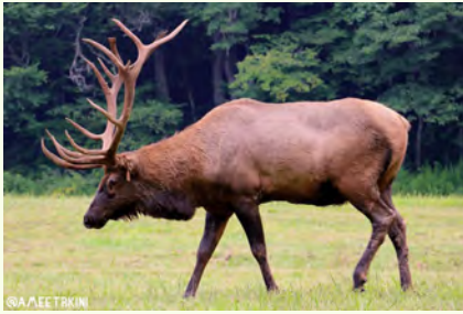
Elk, deer, pronghorn, mountain lions, bobcats and a host of other animals and wildlife habitats are affected by trails.

Connections, is to conserve wildlife habitat while improving trail-based, non-motorized recreation experiences.