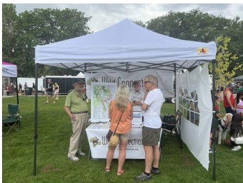
WC and RGPP tabling at Cañon City's 2024 Whitewater Festival.