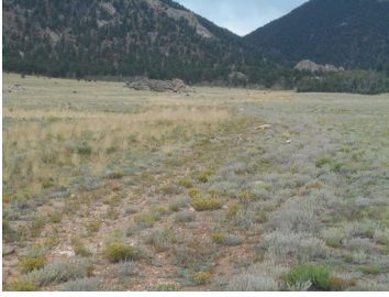
Revegetation on closed routes at La Salle restoration project sites, benefiting Colorado Birds of Special Concern and other area wildlife.

We were also able to get back to our 2020 restoration project area at La Salle, in the Badger Flats area of South Park, where we partnered with the Forest Service to close illegal routes by installing 124 posts with cable in four different sections, followed up by a seeding day. The closed routes help protect Colorado Birds of Special Concern, including golden eagles, bald eagles and Peregrine falcons, which all take refuge in the area.