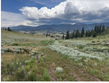
Looking down revegetating route from Wild Connections 2023 North Farnum Roadless Area Restoration Project.