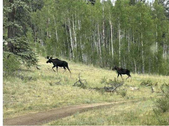
Our (four) closures along Packer Gulch bordering the west side of the Farnum Roadless Area, from our 2022-23 and 2017 restoration projects, are holding up well, with no signs of trespass, creating intact habitat and calving areas for resident wildlife, like this moose family (Mama just offscreen).