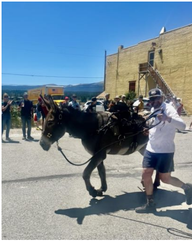
One of the first teams crossing the finish line of the 15-mile race.

Mosquito Pass, starting at 9,953 feet and climbing to 13,185 feet.