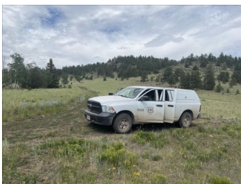
Scouting a potential restoration project with the USFS at the Thirtynine Mile Mountain Roadless Area.