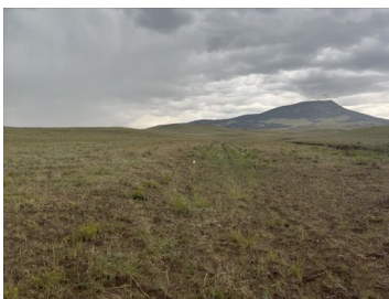
Faint signs of a route across BLM's Cottonwood Creek Backcountry Conservation Area, looking up at FS Black Mountain.

Wild Connections partnered with Quiet Use Coalition to inventory routes and submit public comments for the BLM's new Travel Management Plan for their Thirtyone Mile Mountain and southern South Park area.