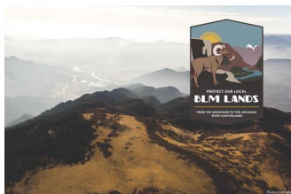
The Arkansas River in Bighorn Sheep Canyon, predominantly comprised of BLM managed wilderness quality public lands.

In late March, the Bureau of Land Management (BLM) announced a proposed rule that would "improve the resilience of public lands in the face of a changing climate, conserve important wildlife habitat and intact landscapes."