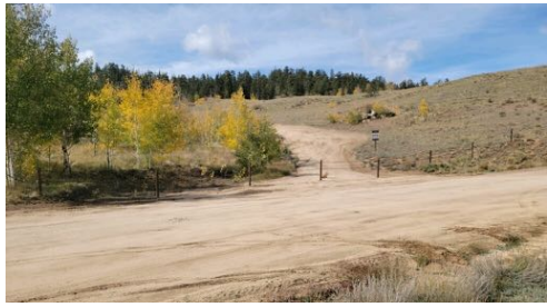
N Farnum will only be secure when the road is ripped and re-vegetated.

Your donations are needed to benefit wildlife, wildlands, and biodiversity this summer.