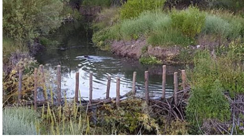
Beaver Dam Analogs will be built in Monument Creek.

>>> Restore North Farnum (FR233) , an illegal route near Tarryall reservoir was closed in 2022. Fund heavy equipment to rip up the illegal roads and reseed in the closed area, an important corridor for wildlife in South Park.