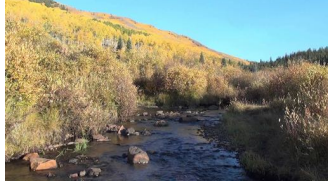
USFS South Platte Ranger District's Kenosha Creek.

Wild Connections is assisting the Forest Service South Platte Ranger District with riparian repair along the banks of Kenosha Creek, east of Kenosha Pass along the Lost Creek Wilderness Area. We need volunteers to help in small groups on one or more days. The project involves working for the Forest Service Restoration Team doing shovel work along the banks of the creek. Wild Connections and the Forest Service would provide tools and waders.