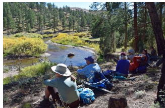
Wild Connections 2017 Wildcat Canyon Hike.

Join us for a fairly casual 5 mile round trip hike to the scenic viewpoint overlooking this impressive South Platte River canyon.