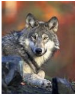
Gray Wolf.

Yesterday, the Colorado Parks and Wildlife Commission approved a final plan to reintroduce gray wolves in Colorado, following up on a ballot initiative that was approved by Colorado voters in 2020.