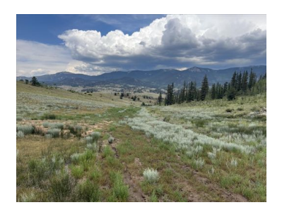
Looking down revegetating route from Wild Connections 2023 North Farnum Roadless Area Restoration Project.