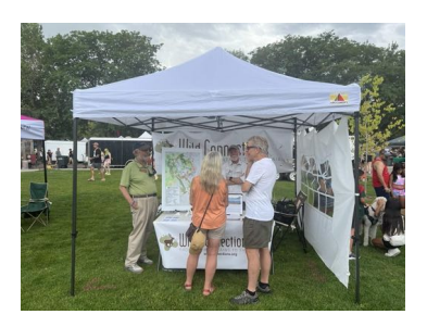
WC and RGPP tabling at Cañon City's 2024 Whitewater Festival.

Our (four) closures along Packer Gulch bordering the west side of the Farnum Roadless Area, from our 2022-23 and 2017 restoration projects, are holding up well, with no signs of trespass, creating intact habitat and calving areas for resident wildlife, like this moose family (Mama just offscreen).