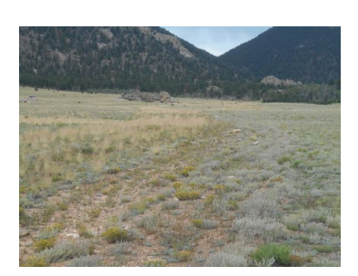
Revegetation on closed routes at La Salle restoration project sites, benefiting Colorado Birds of Special Concern and other area wildlife.