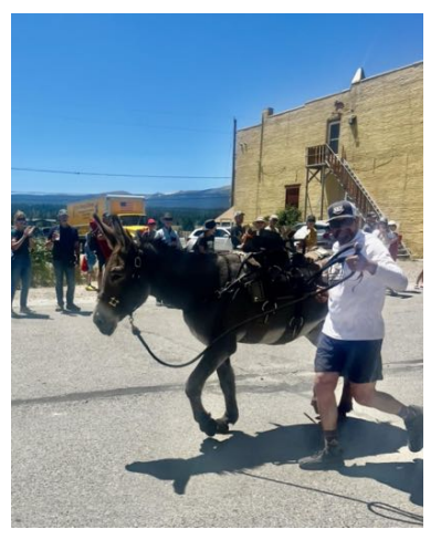
One of the first teams crossing the finish line of the 15-mile race.

Mosquito Pass, starting at 9,953 feet and climbing to 13,185 feet.