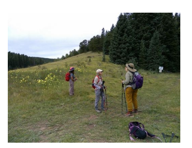
WC 2024 North Catamount Creek hike.

Be on the lookout for this upcoming outing, which will be announced soon!