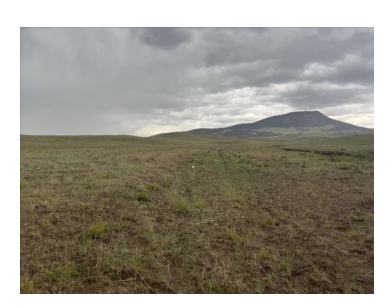
Faint signs of a route across BLM's Cottonwood Creek Backcountry Conservation Area, looking up at FS Black Mountain.

Wild Connections' India West and Jim Lockhart hosted a booth at the event and delivered a presentation on our Central Colorado Climate Corridors and Refugia Project. It was wonderful to connect with attendees and event partners, creating greater awareness and opening up the conversation about vital environmental and conservation issues in our region.