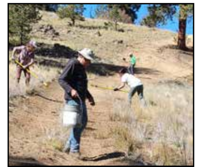
Volunteers and staff and their tools, spreading seeds on the scarified roadbed, some areas required hand work with mattocks and rakes before seeding.