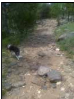
Eroded user created trail.

Based on our field work, we participated in the 2001-2017 efforts that led to the Colorado Roadless Rule. WC promoted citizen involvement in public meetings and written comments. We submitted our area inventory data, and 107,400 acres was added to the PSI inventory based substantially on our research. The Colorado Roadless Rule was a significant step forward in protecting roadless areas from road construction and commercial activities.