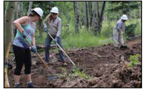
Preparing Packer Gulch tracks for seeds.

Packer Gulch on the northwest side had illegal tracks from FR 144 running miles into the roadless area. Volunteers and the Forest Service installed post and cable, planted native grasses and laid down brush and logs to block these trails. This reduced fragmentation of the habitat and disturbance to wildlife.