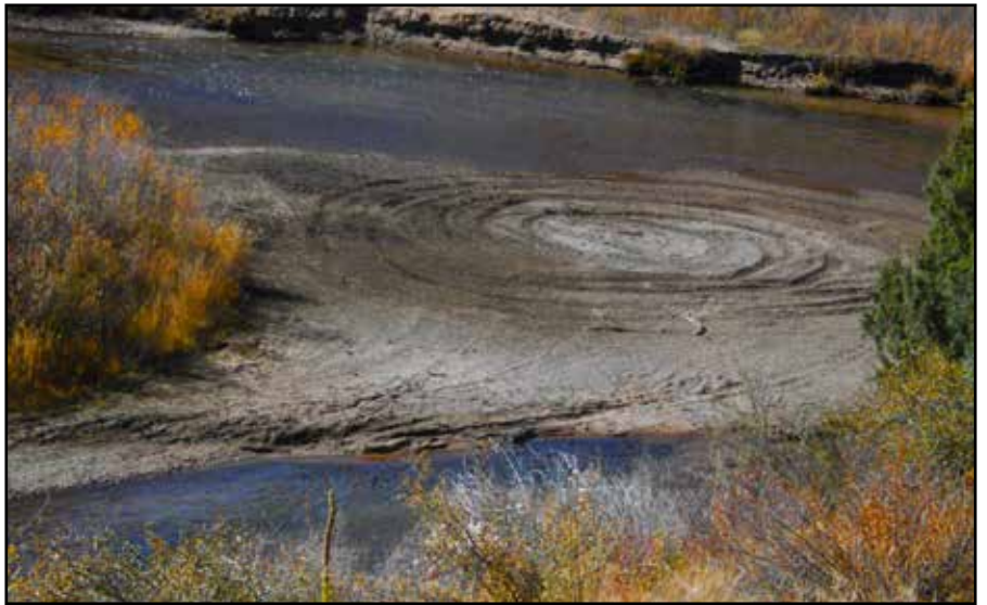
Wheelies at the river's edge.

Last year's Pike-San Isabel Travel Management Plan confirmed the decommissioning of these old routes on both the east and west sides of the river. This set the stage for future restoration across the area. In 2022 Wild Connections arranged removal of unneeded metal signs, posts, and cable with funding from the Park County Land and Water Trust Fund – an important first step toward implementing the travel management plan and restoring Wildcat Canyon to its outstanding natural state.