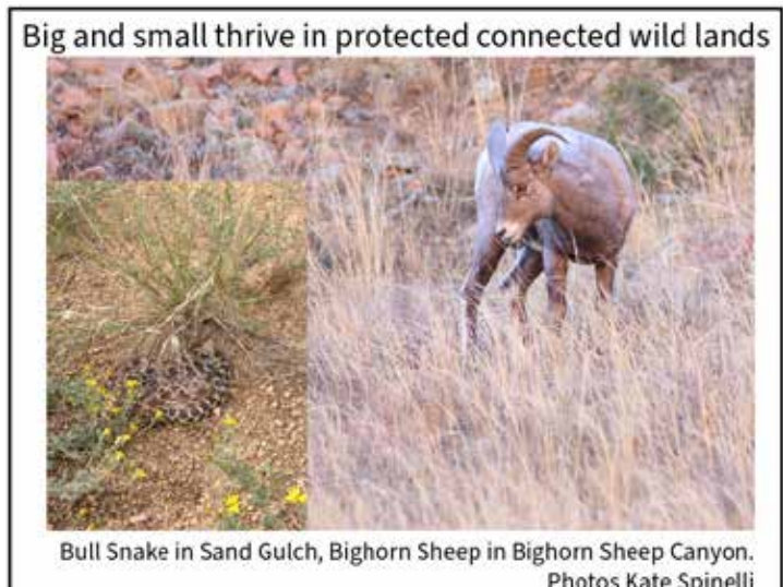
Big and small thrive in protected connected wild lands