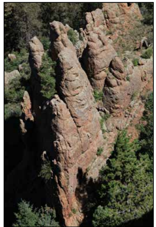
Looking down on the hoodoos below the Cooper Mountain overlook.

Fortunately that plan never came to fruition. This was fortunate for the BLM as well since they are still rectifying similar management planning efforts that were finalized in western Colorado, but immediately challenged by the state and others. Not wanting to go down this same path, the RGFO kept revising and reanalyzing the ECRMP draft revision, until it was finally made public this summer as the proposed ECRMP. It had a 30-day public protest period, and a 60-day governor's review period.