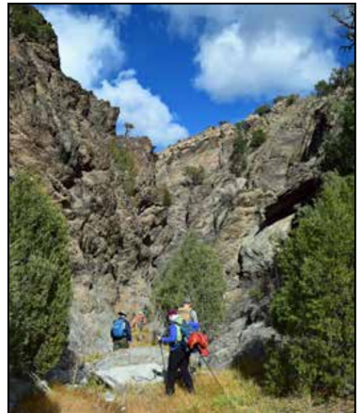
Hikers explore the wilderness characteristics in McIntyre Wilderness Study Area.

This planning process, known as the Eastern Colorado Resource Management Plan (ECRMP) revision, officially began in 2015. An RMP, much like a master plan, describes broad multiple-use guidance for managing lands and federal mineral estates (such as oil or coal) administered by the BLM for the foreseeable future. It will manage wildlife, water, cultural resources, recreation