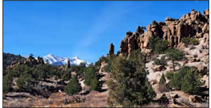
Snowy Collegiate Peaks over BCNM hoodoo rock spires.

It was wonderful to partner with FOBC. They are the local stewards of BCNM working with the local management agencies and were deeply involved in achieving the monument status in 2015. Additionally, FOBC coordinated with Forest Service's (USFS) Salida Ranger District for this event, securing us approval and access past a USFS administrative gate, which provided for a very special outing for this lucky group.