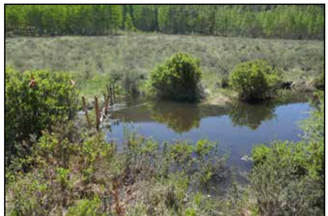
One of many Beaver Dam Analogs constructed along this stream in the Pike National Forest expands wetlands and beaver habitat.