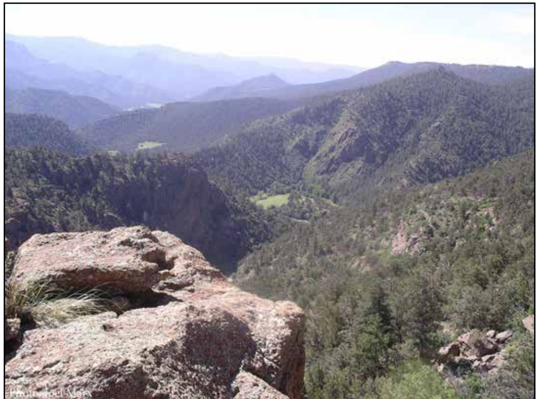
The rolling hills and canyons show the range of ecosystems found on BLM lands.

This has been a very long campaign to protect local BLM public lands and waters through the ECRMP planning process. Thanks to all of you that have made this possible, whether through comments, donations, joining our events, or spreading the message. This would not have been possible without your support! ☺