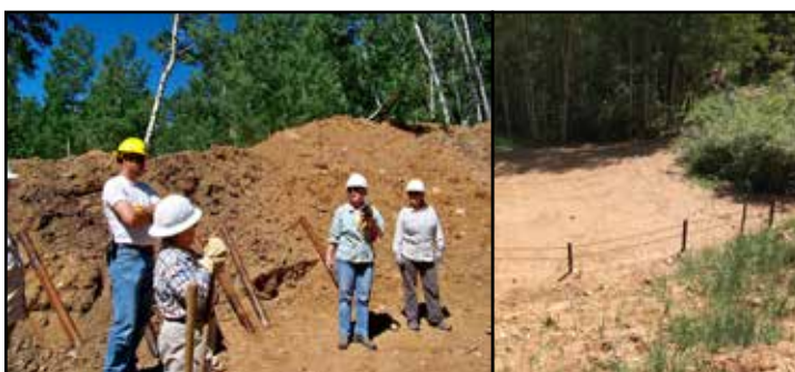
Large berms and cable fences at the closure, placing logs and brush to reduce erosion, vegetation in 2018.

A small trail closed: big lands reconnected.