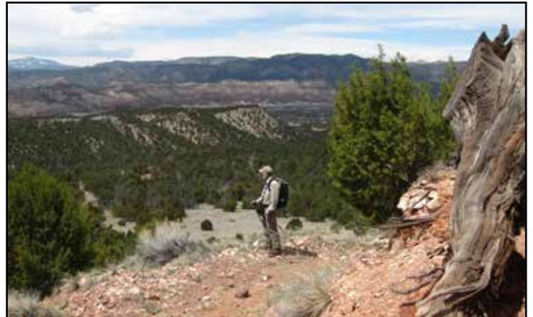
Oil Well Flats trails lead to views across these BLM lands.