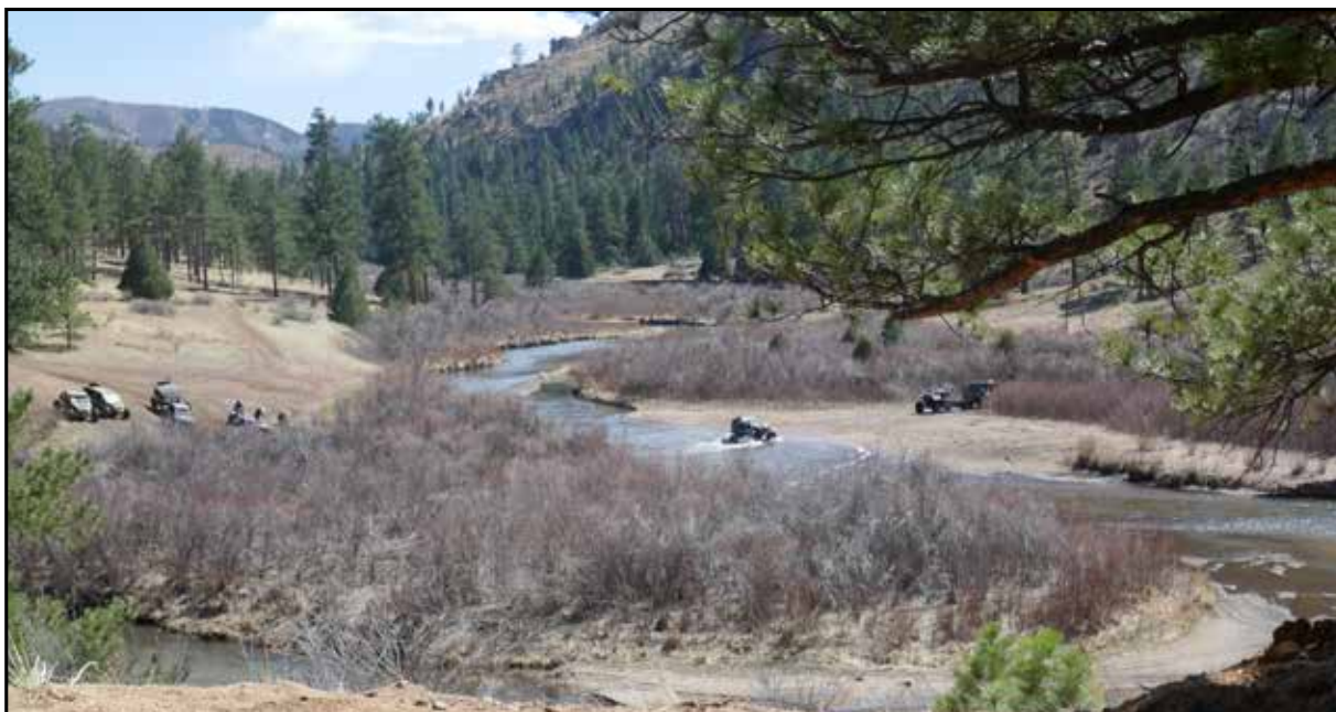
Trespassing vehicles roil up the river.

The Forest Service is now completing engineering plans to design effective route closures. Until these closures can be put in place, they are faced with a difficult situation, since they have limited staff available for enforcement and often encounter hostile motorized users. When the time comes to put effective closures in place, Wild Connections plans to help with the restoration of the damage which motorized use has caused to the area. ☹️