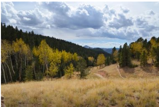
Mixed forests along the trail at Mueller State Park